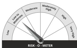
Scheme Risk O Meter

Investors understand that their principal will be at Low to Moderate Risk