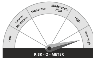
Scheme Risk O Meter

Investors understand that their principal will be at Very High Risk