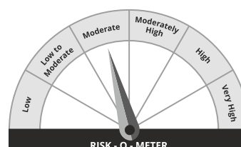
Benchmark Risk O Meter

(It may be noted that risk-o-meter specified above is based on the scheme characteristics. The same shall be updated in accordance with provisions of SEBI circular dated October 5, 2020 on Product labelling in mutual fund schemes on ongoing basis.)