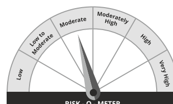
Benchmark Risk O Meter

(It may be noted that risk-o-meter specified above is based on the scheme characteristics. The same shall be updated in accordance with provisions of SEBI circular dated October 5, 2020 on Product labelling in mutual fund schemes on ongoing basis.)