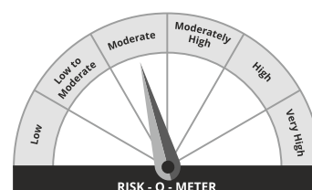
Benchmark Risk O Meter

(It may be noted that risk-o-meter specified above is based on the scheme characteristics. The same shall be updated in accordance with provisions of SEBI circular dated October 5, 2020 on Product labelling in mutual fund schemes on ongoing basis.)