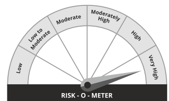
Benchmark Risk O Meter

RISK - O - METER Investors understand that their principal will be at Very High Risk