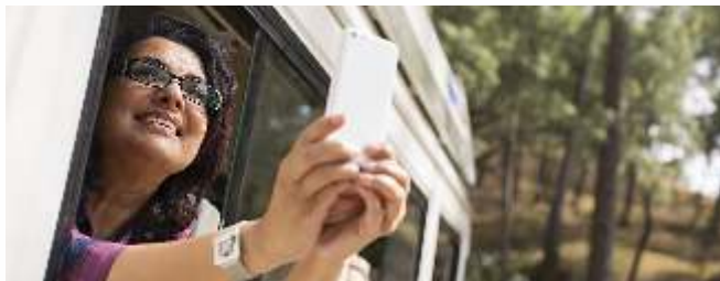
Capturing Memories Non-Stop even after retirement! #MERIAAZADI !