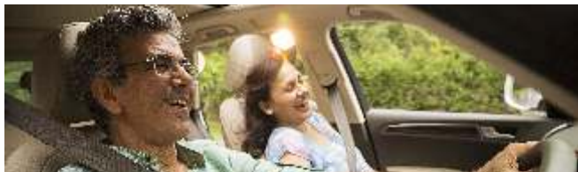
A weekday break to a weekend place even after retirement! #MERIAAZADI !