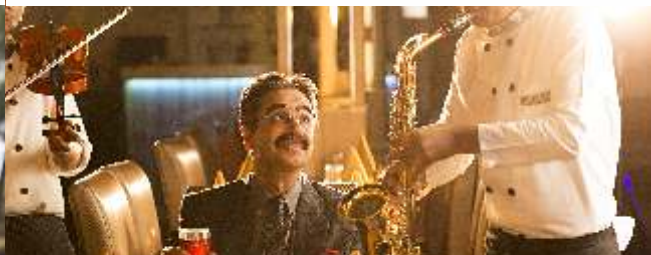
Being Celebrated by Loved Ones even after retirement! #MERIAAZADI !