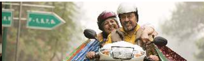
Living it up like GenNext even after retirement! #MERIAAZADI !