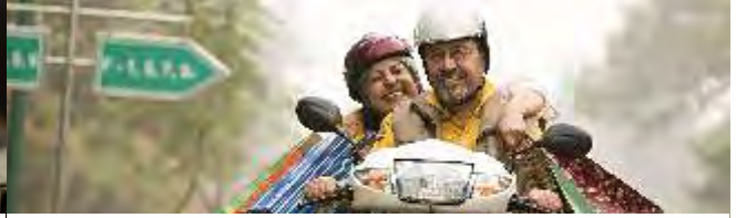
Living it up like GenNext even after retirement! #MERIAAZADI !