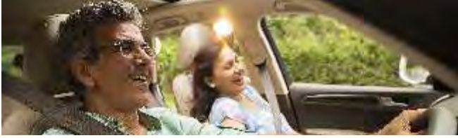
A weekday break to a weekend place even after retirement! #MERIAAZADI !