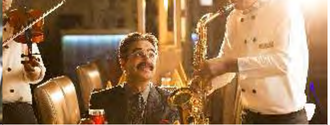
Being Celebrated by Loved Ones even after retirement! #MERIAAZADI !