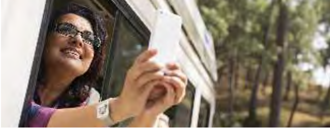
Capturing Memories Non-Stop even after retirement! #MERIAAZADI !