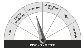
Benchmark Risk O Meter (Nifty G-Sec Dec 2029 Index)

Investors understand that their principal will be at Moderate Risk