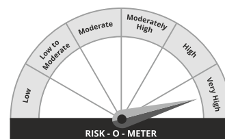
Benchmark Risk O Meter

(It may be noted that risk-o-meter specified above is based on the scheme characteristics. The same shall be updated in accordance with provisions of SEBI circular dated October 5, 2020 on Product labelling in mutual fund schemes on ongoing basis.)