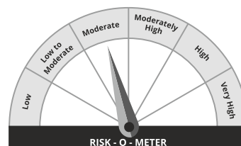
Benchmark Risk O Meter

RISK - O - METER Investors understand that their principal will be at Moderate Risk