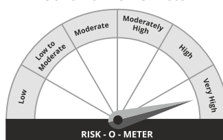
Scheme Risk O Meter

RISK - O - METER Investors understand that their principal will be at Very High Risk