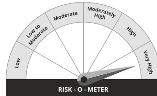
Risk-O-Meter of Tata Nifty India Digital ETF Fund of Fund

RISK - O - METER Investors understand that their principal will be at Very High Risk