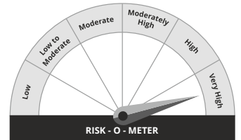
Risk-O-Meter of Nifty India Digital Index

RISK - O - METER Investors understand that their principal will be at Very High Risk