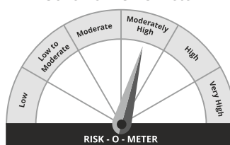
Scheme Risk O Meter

RISK - O - METER Investors understand that their principal will be at Moderately High Risk