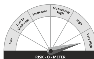
Benchmark Risk O Meter

RISK - O - METER Investors understand that their principal will be at Very High Risk